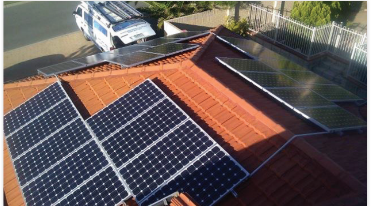
Multi-orientation roof with partial shading and different size modules connected in a single string to the SolarEdge inverter

Prior to speaking with PPT, the customer had a 3kW system consisting of 170W panels, split across two roof facets facing opposite directions, they were connected to a traditional single input string inverter. As a result, the customer was suffering disproportionate energy losses. Additional energy loss was caused by local trees and structures which created progressive partial shading in the morning and afternoon. PPS knew that this problem could be solved by utilizing the SolarEdge system, which consists of a SolarEdge inverter and power optimizers providing module-level MPPT.