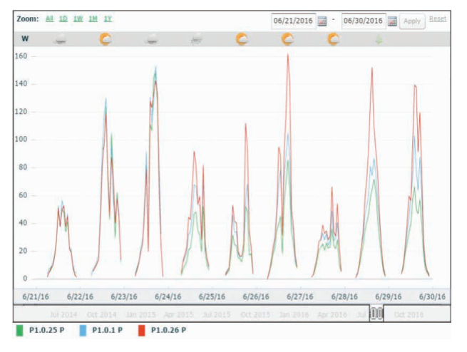
The graph for Site 1 shows failing panels P1.0.25 P, P1.0.1 P compared to reference panel P1.0.26 P.

By analysing and comparing the performance of three panels in a PV system, a noticeable decrease in production for two of the panels can be seen beginning on June 24, 2016, one day after the hailstorm.