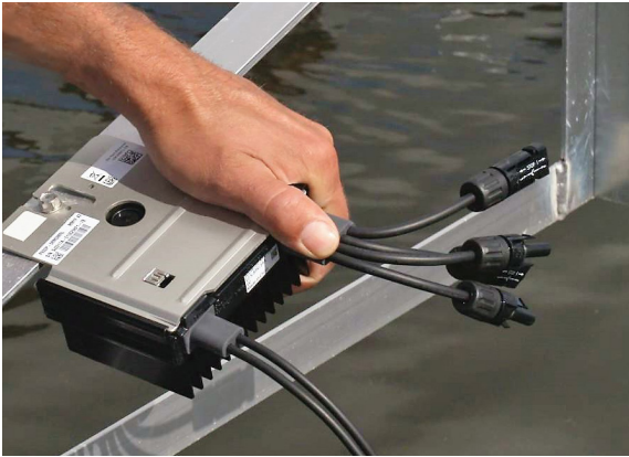
The installation includes 1195 power optimizers which reduce module-level mismatch, maximizing the energy collected from each module.

In addition, every power optimizer is equipped with the SafeDC™ feature, which is designed to automatically reduce modules' DC voltage to a safe level.