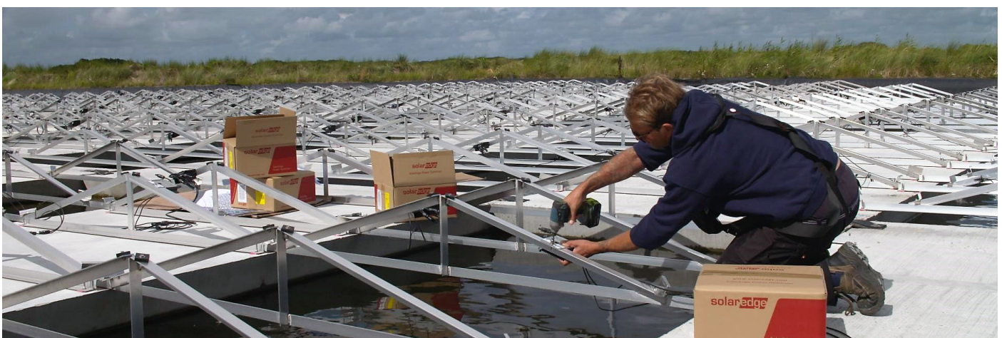
The PV installation was set on a concrete pontoon above the reservoir.