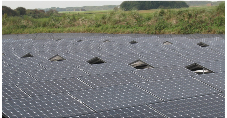
SolarEdge's design flexibility enables the system to maximize yield even from modules at different tilts and orientations.