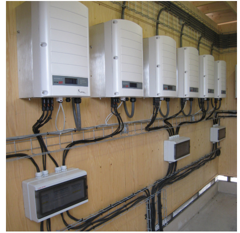
24 x SE27.6K inverters are installed next to the pond.

Floating PV installations come with many benefits, but also have unique design and maintenance considerations. Modules and components require planning for attaching on to concrete pontoons or plastic floats. The fact that the modules are located on water makes on-site monitoring and maintenance of the installation, and the safety of maintenance personnel, potentially more challenging due to location and access issues. SolarEdge power optimizers monitor the performance of modules and communicate performance data to the web-based SolarEdge monitoring platform, reducing the number of actual site visits needed and the time spent on-site in each visit.