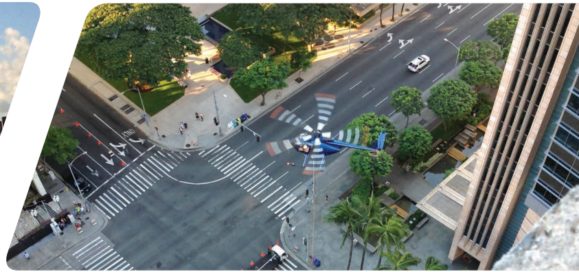
Bank of Hawaii- Access to the rooftop was a challenge. The team required helicopters to lift all materials to the installation site