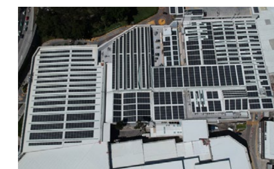
Big Box Stores