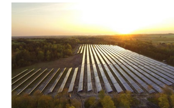
Community Solar/Ground Mount