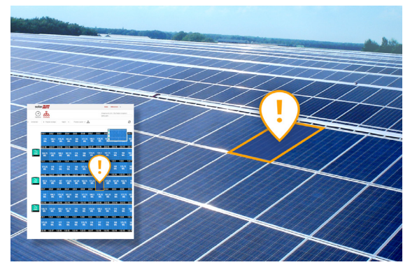
Pinpointed system alerts at the module level