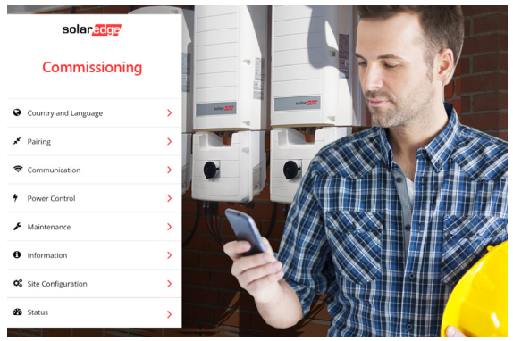
Inverter activation and commissioning direct from your smartphone