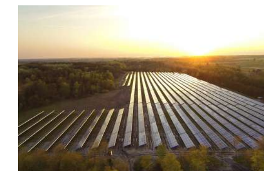
Community Solar/Ground Mount